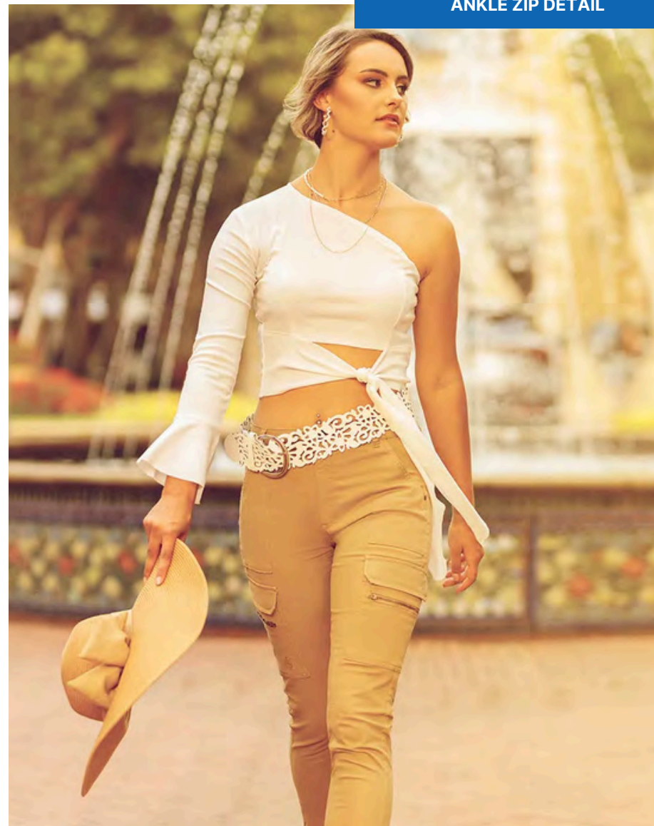
ANKLE ZIP DETAIL

SIZE AVAILABLE ON REQUEST: 28 30 32 34 36 38 40 42 44