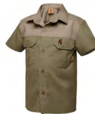
OLIVE & PUTTY