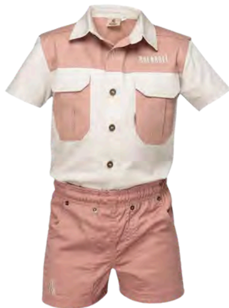
STONE & BLUSH PINK

SIZE AVAILABLE ON REQUEST: 1-2Y 3-4Y 5-6Y 7-8Y 9-10Y 11-12Y