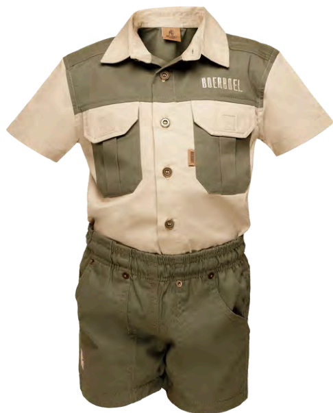
OLIVE & STONE

Dress your little one in the kid's version of our popular shirts, along with an accompanying PT Short.