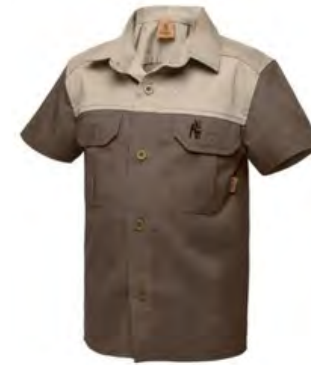
BARK & STONE